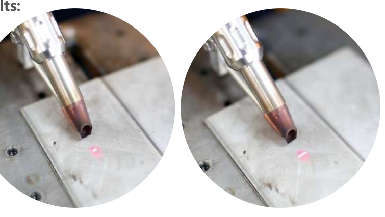
Wobble Width: 0-5mm